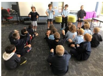
Big Black Train Three Part Round