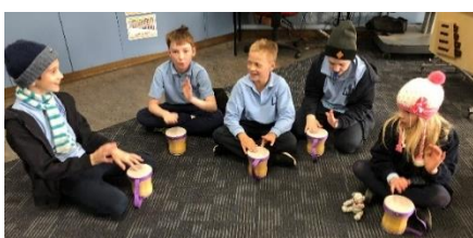
Composing a Melody for Two Little Sausages

Both LSU and LSUA classes actively participate in music lessons each week. LSUA senior students are learning to play the recorder.