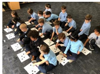
Music Staff Notation