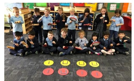
See Saw Rhythm Writing