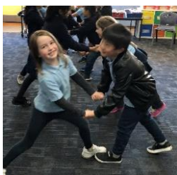
Billy Billy Dance