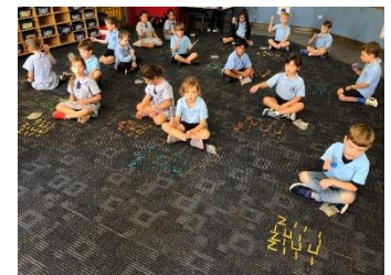
1,2,3 Rhythm Writing

The senior school has an instrumental based program which also includes activities such as listening, moving, dancing and the playing of tuned and untuned instruments. The students are learning to play the recorder, xylophone, glockenspiel and boomwhackers. They are given opportunities to perform for their classmates and have recently performed a short piece of music they composed the melody for.